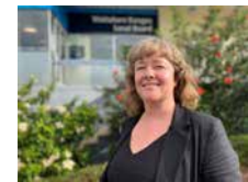
Ngā mihi mahana

It’s a big job, but I am confident we are up to the task, which becomes all the more vital as time goes on.