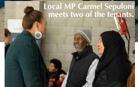
Local MP Carmel Sepuloni meets two of the tenants.

Built by Kāinga Ora Homes and Communities with support from the Ministry of Housing and Urban Development, the one-bedroom homes were designed by the Ministry of Architecture and Interiors to meet the specific needs of older people.