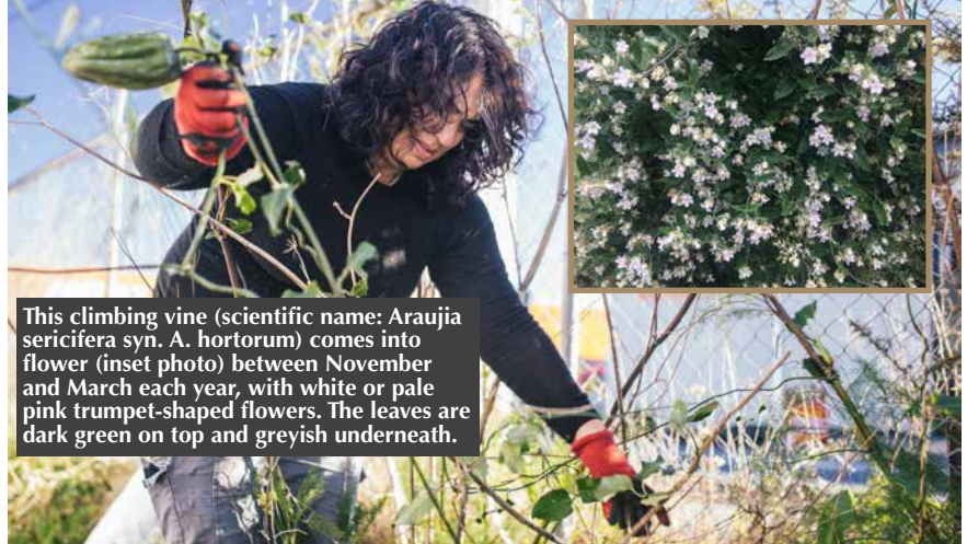
This climbing vine (scientific name: Araujia sericifera syn. A. hortorum ) comes into flower (inset photo) between November and March each year, with white or pale pink trumpet-shaped flowers. The leaves are dark green on top and greyish underneath.

joining STAMP (Society Totally Against Moth Plant, on Facebook) or learn more about how to get rid of it at Auckland Council’s Tiaki Tāmaki Makaurau (Conservation Auckland) website: https://bit.ly/mothplant .